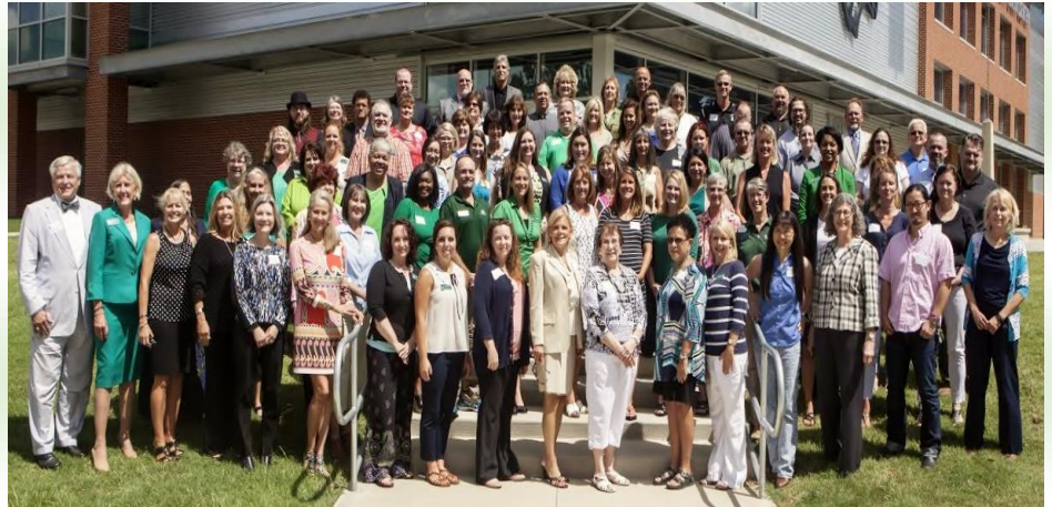
COLLEGE OF EDUCATION FACULTY AND STAFF 2015-2016