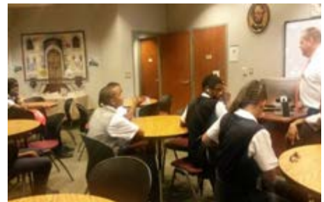
KIPP students learning about some of the benefits available to teachers.