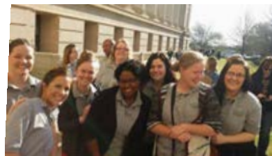
Above: TURN students visit the Oklahoma capitol!