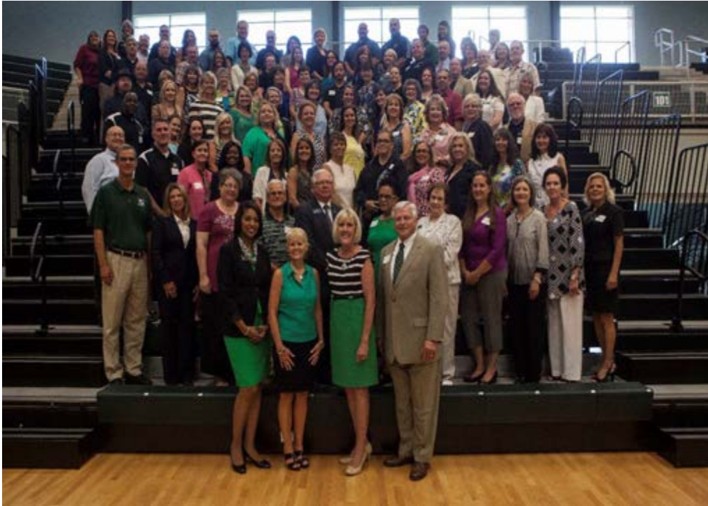
COLLEGE OF EDUCATION FACULTY AND STAFF 2014-2015