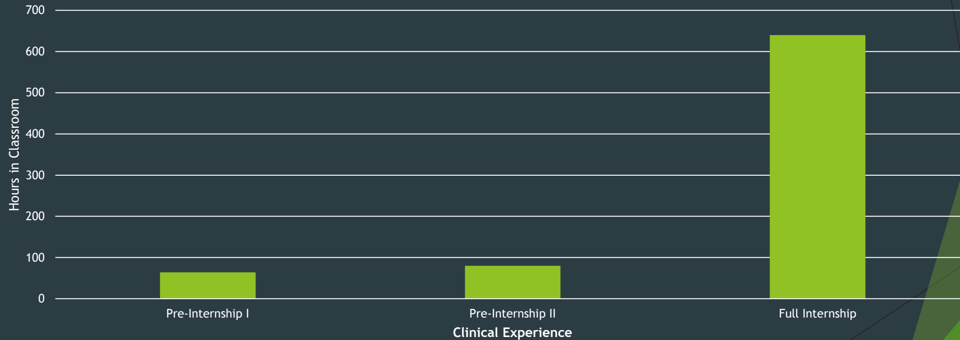
NSU Teacher Candidates' Clinical Hours in Classroom

NSU teacher candidates spend a minimum of 784 clinical hours learning in the classroom alongside experienced teachers. They are required to complete additional hours in their teacher education coursework.